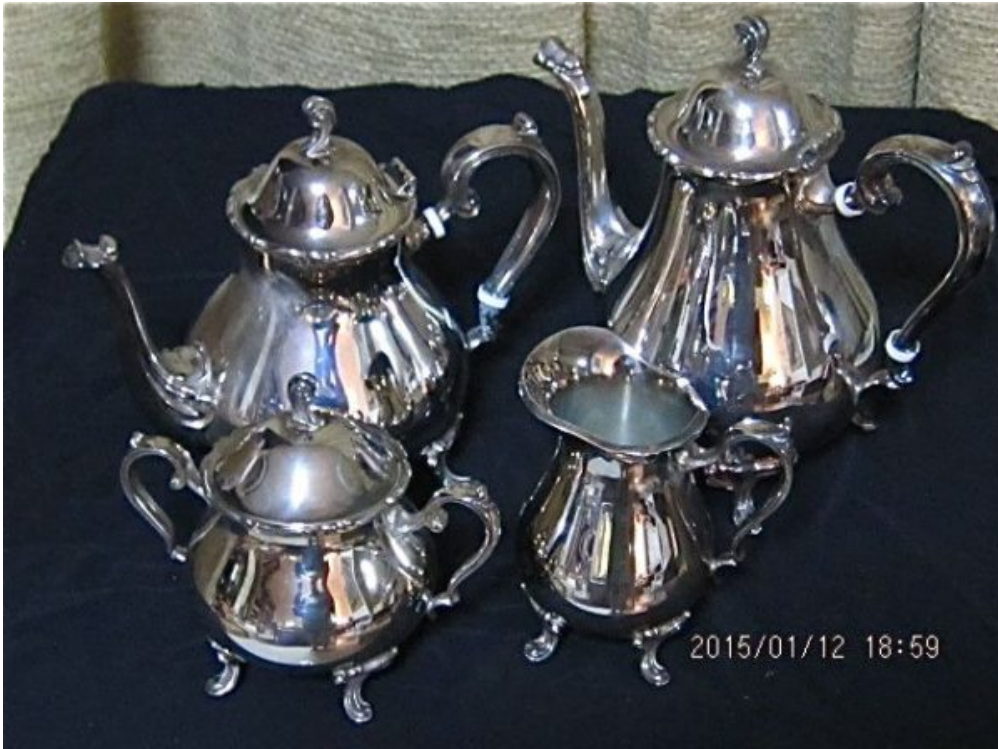
Rodd Coffee/tea set

VINTAGE ITEM: A beautiful, graceful set of relatively recent date, consisting of a coffee and a tea pot, a jug & a sugar bowl with its lid.