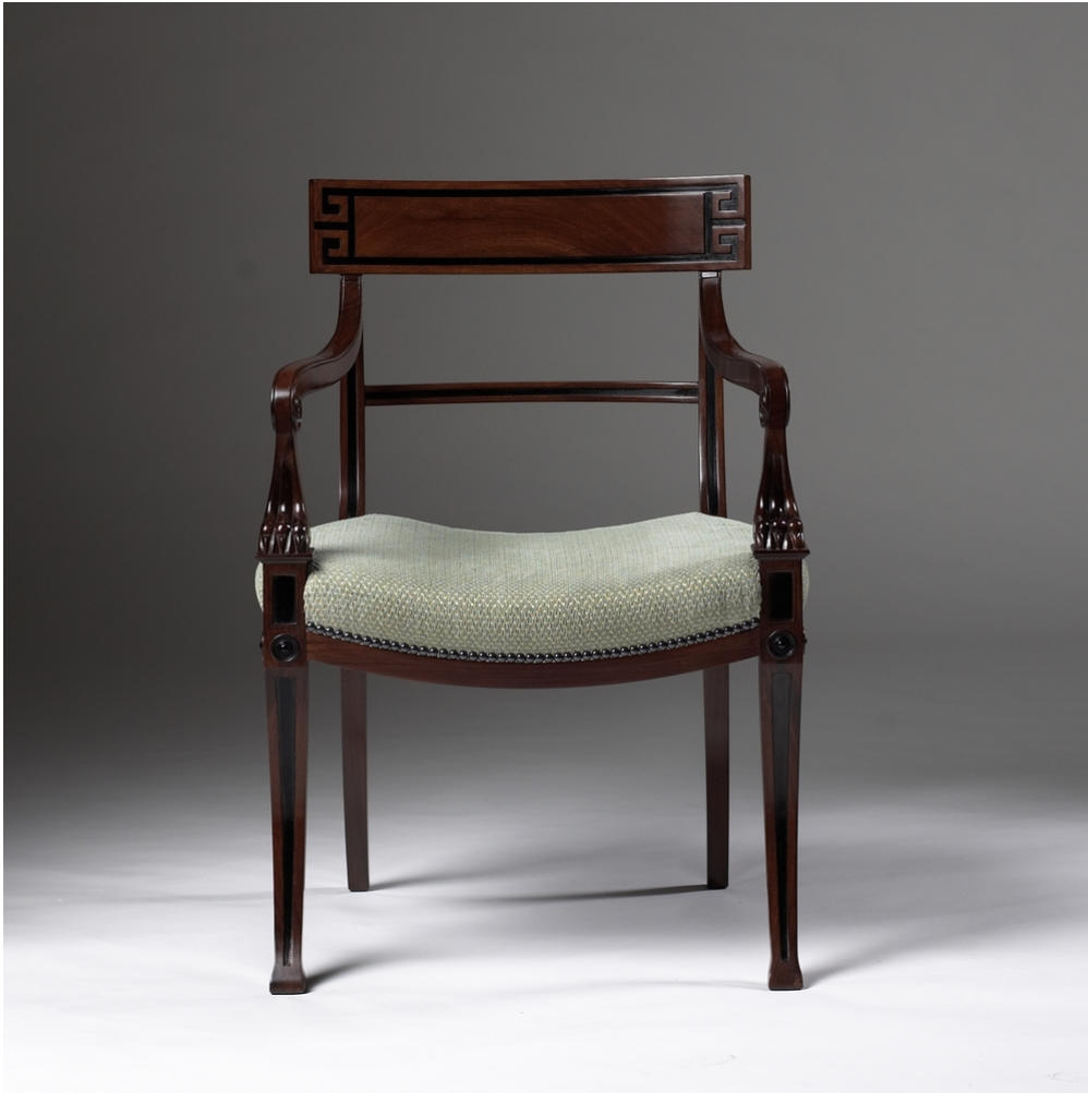
Classic Regency Elbow Chair dining or desk chair