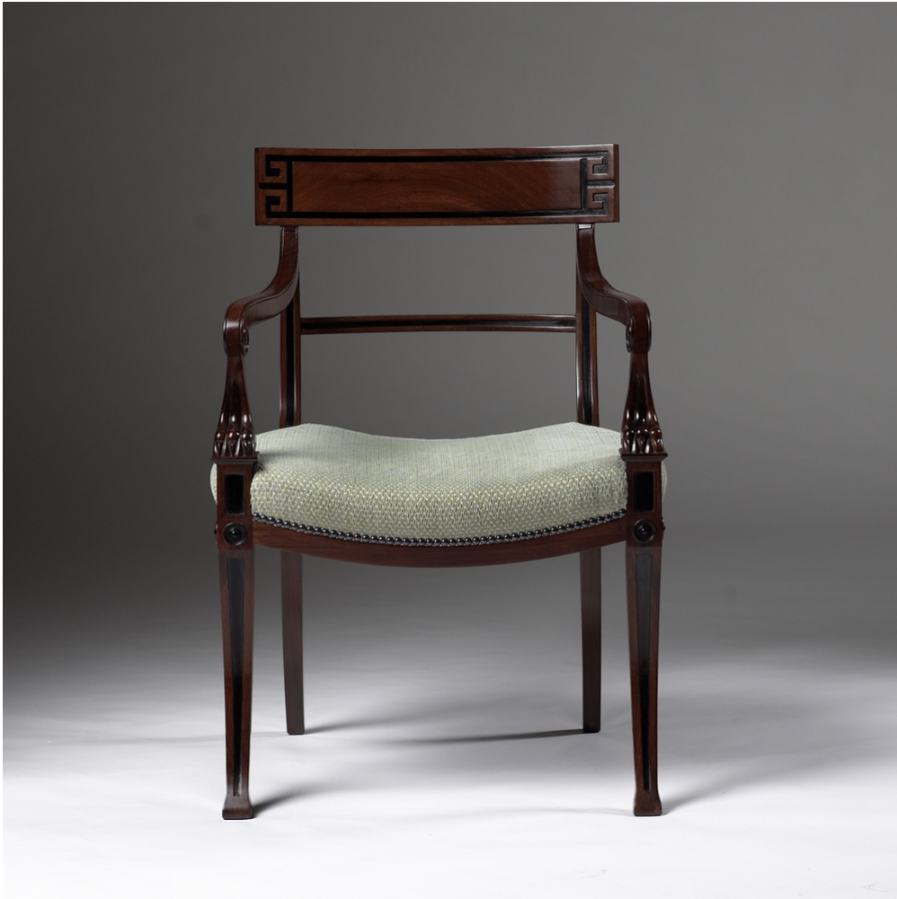
Classic Regency Elbow Chair dining or desk chair