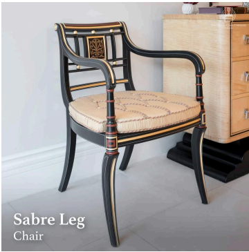
Sabre Leg Chair