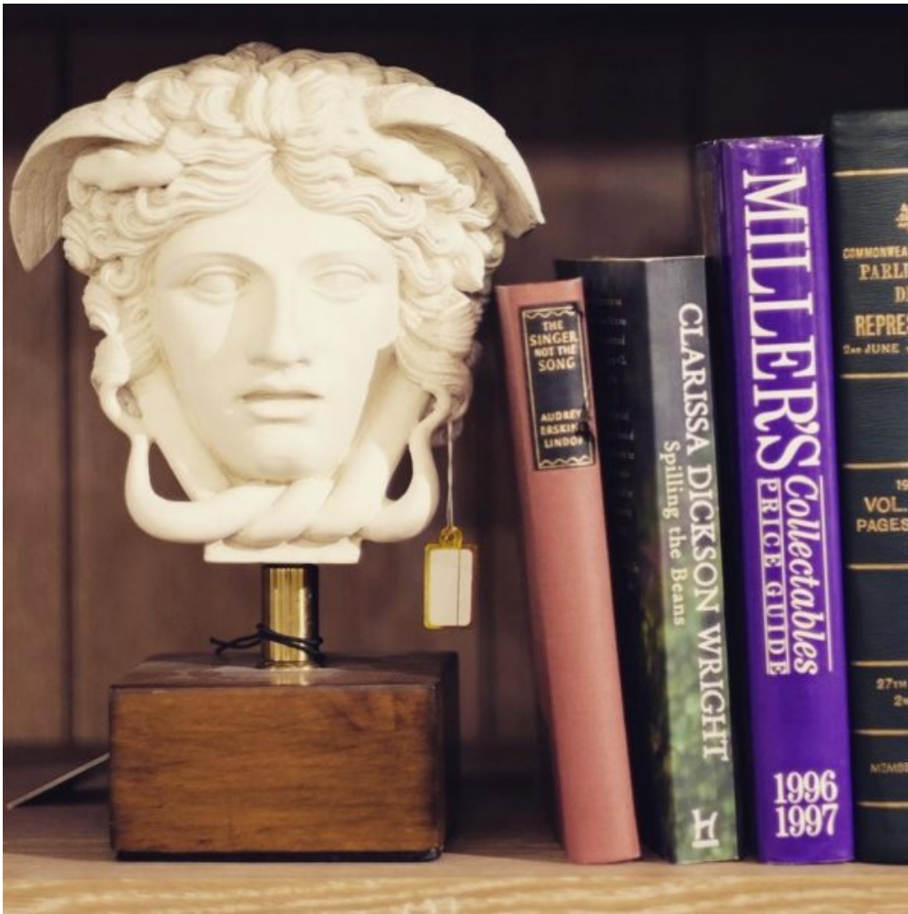
Medusa head sculpture.

In Greek mythology, Medusa (Μέδουσα "guardian, protectress"), also called Gorgo , was one of the three monstrous Gorgons generally described as winged human females with living venomous snakes in place of hair. Those who gazed into her eyes would turn to stone. Medusa was beheaded by the Greek hero Perseus. There are many, many stories about her abilities, her life and her attributes.