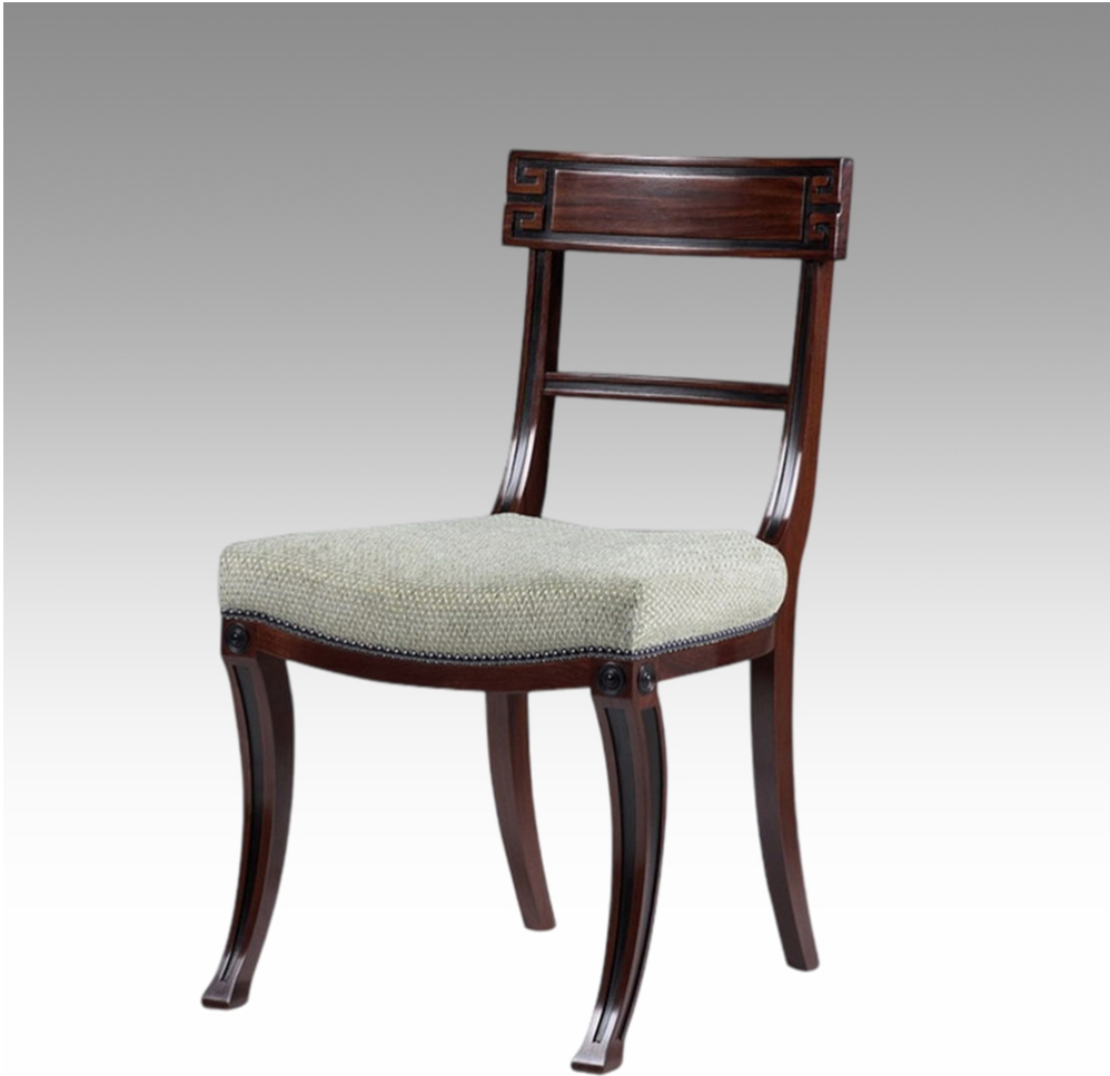
The Classic Regency Side Chair