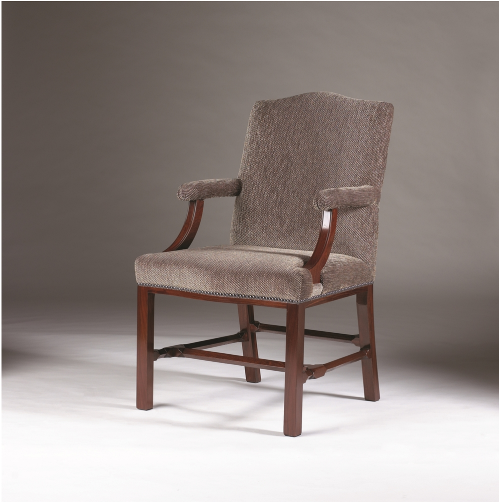
The Classic Gainsborough Side Chair

This ever popular design is an exact replica of an English Georgian period original, which was marked with the date of 1767.