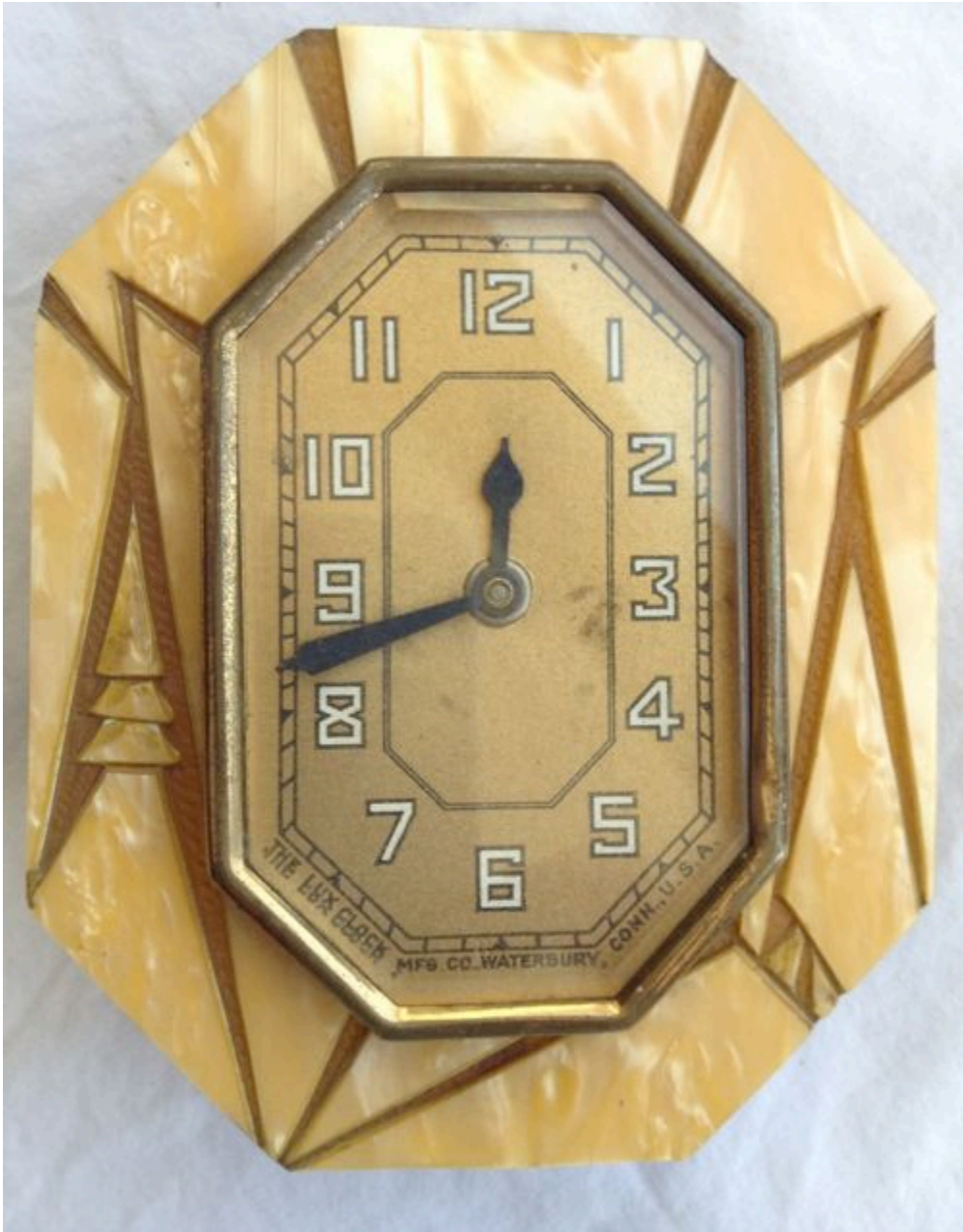
"LUX" ART DECO CLOCK