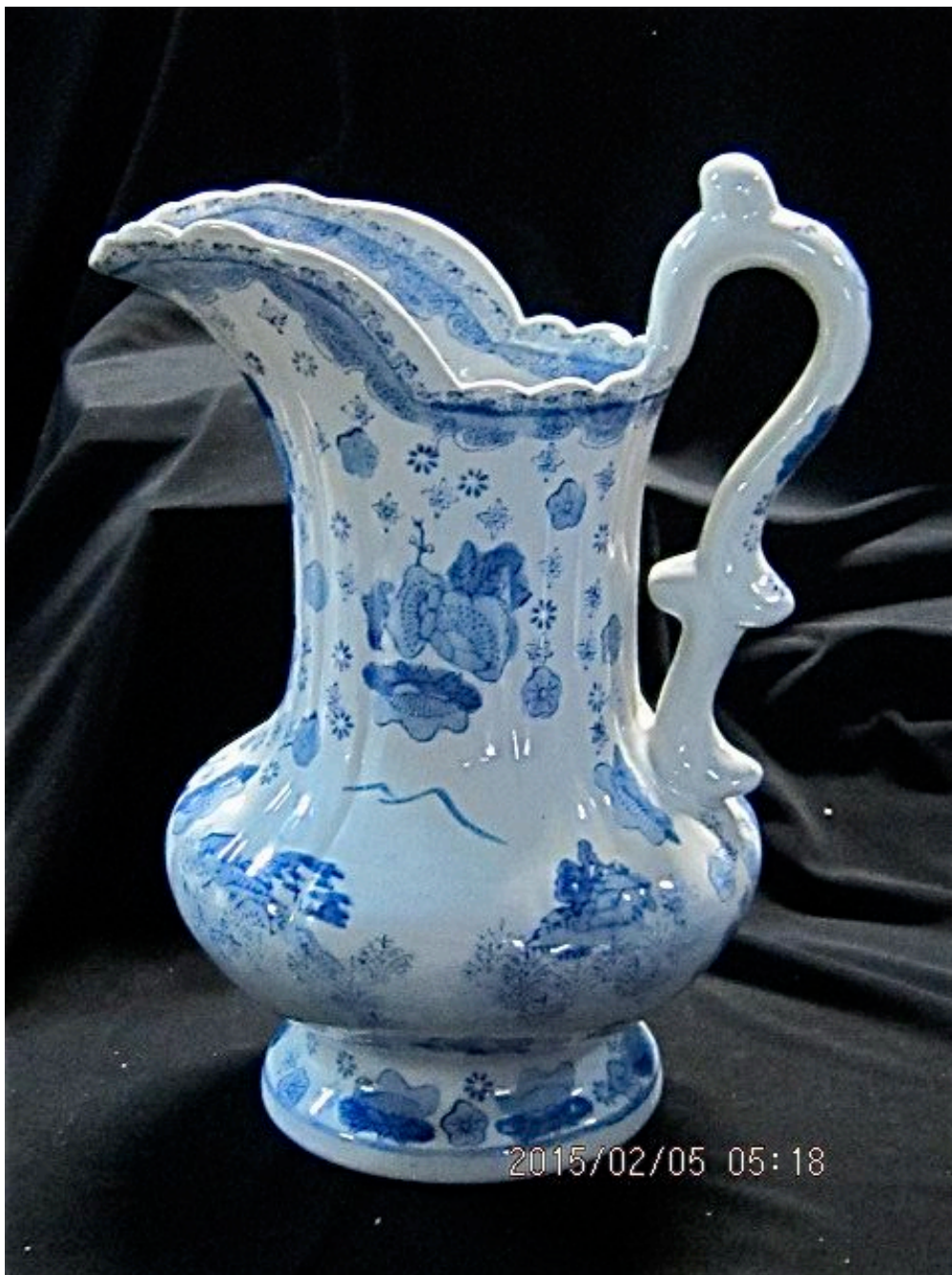
JAPANESE EWER JUG G107