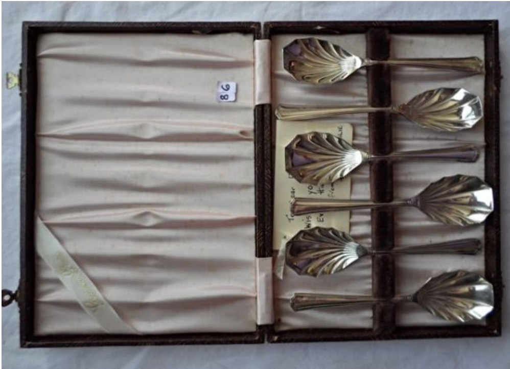
GROSVENOR shell spoons, boxed set.

VINTAGE ITEM: A set of 6 silver plated shell spoons with a double banding, the bowls of fluted and angled outline, stamped GROSVENOR DELPHIC EPNS A1