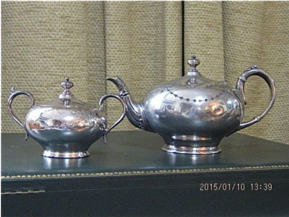
DIXON tea & sugar

VINTAGE ITEM: A silver plated tea pot and a sugar bowl by DIXONS, with good detailing of raised bands to the spout and inset cream bands to the handle.