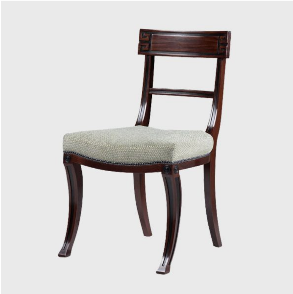
The Classic Regency Side Chair