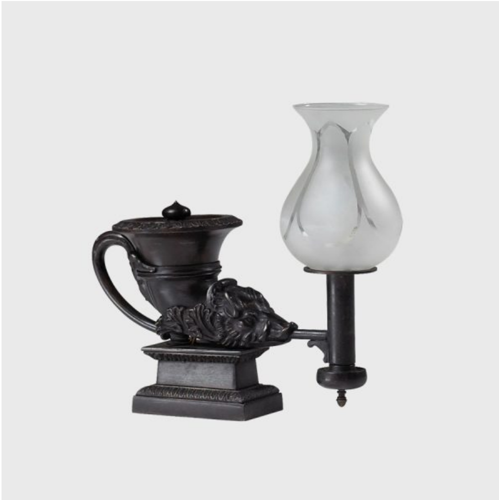
Boar's Head Argand lamp